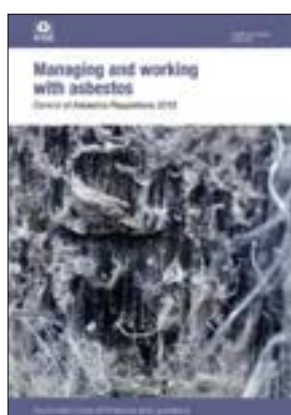
L143 (Second edition) Published 2013

This publication contains the Control of Asbestos Regulations 2012, the Approved Code of Practice (ACOP) and guidance text. Two ACOPs, L127 ( The management of asbestos in non-domestic premises ) and L143 ( Work with materials containing asbestos ) have been consolidated into this single revised ACOP. The presentation and language has been updated wherever possible. It provides guidance text for employers about work which disturbs, or is likely to disturb, asbestos, asbestos sampling and laboratory analysis. It also provides guidance on the specific duty to manage asbestos on the owners and/or those responsible for maintenance in non-domestic premises.